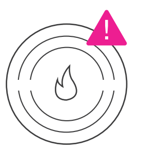
Monitored Fire Alarm