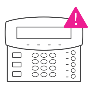
Back-to-Base Security Alarm