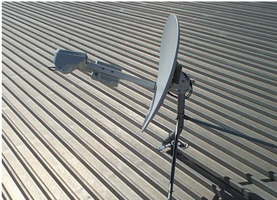
Product or Service Image