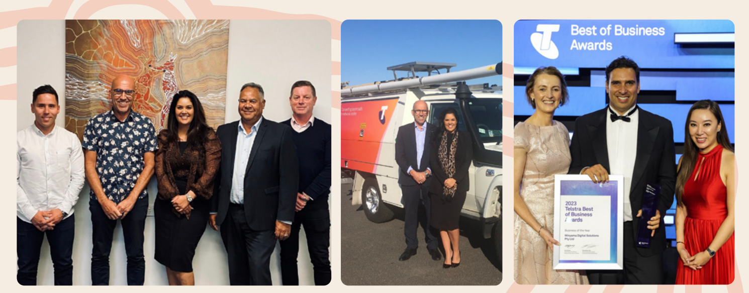
Kooya Fleet Solutions