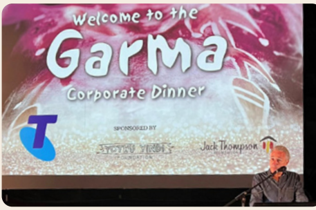
2022 Garma Corporate Dinner