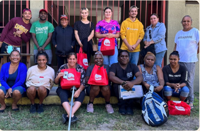
First Nations Connect Hotline training, Jumbun group