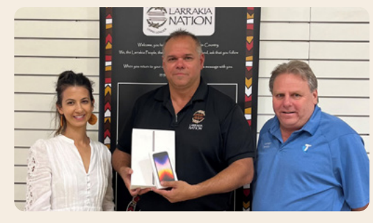
Larrakia Nation Aboriginal Corporation