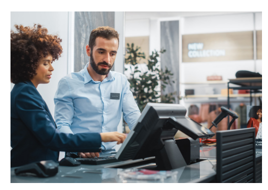
Store to Store performance comparisons

Understand how customers move and interact with your store. Use these insights to inform stores layouts, checkout locations and improve staff rostering.