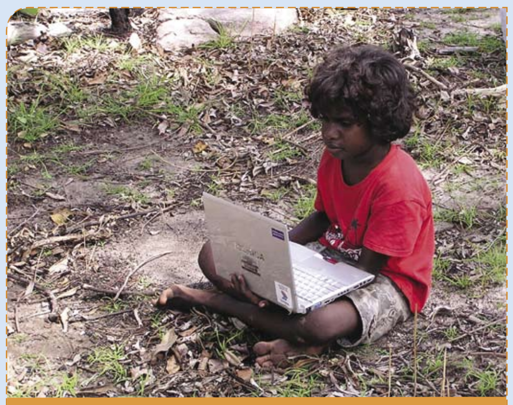
High speed broadband access provides significant benefits for the Arnhem Land communities involved.