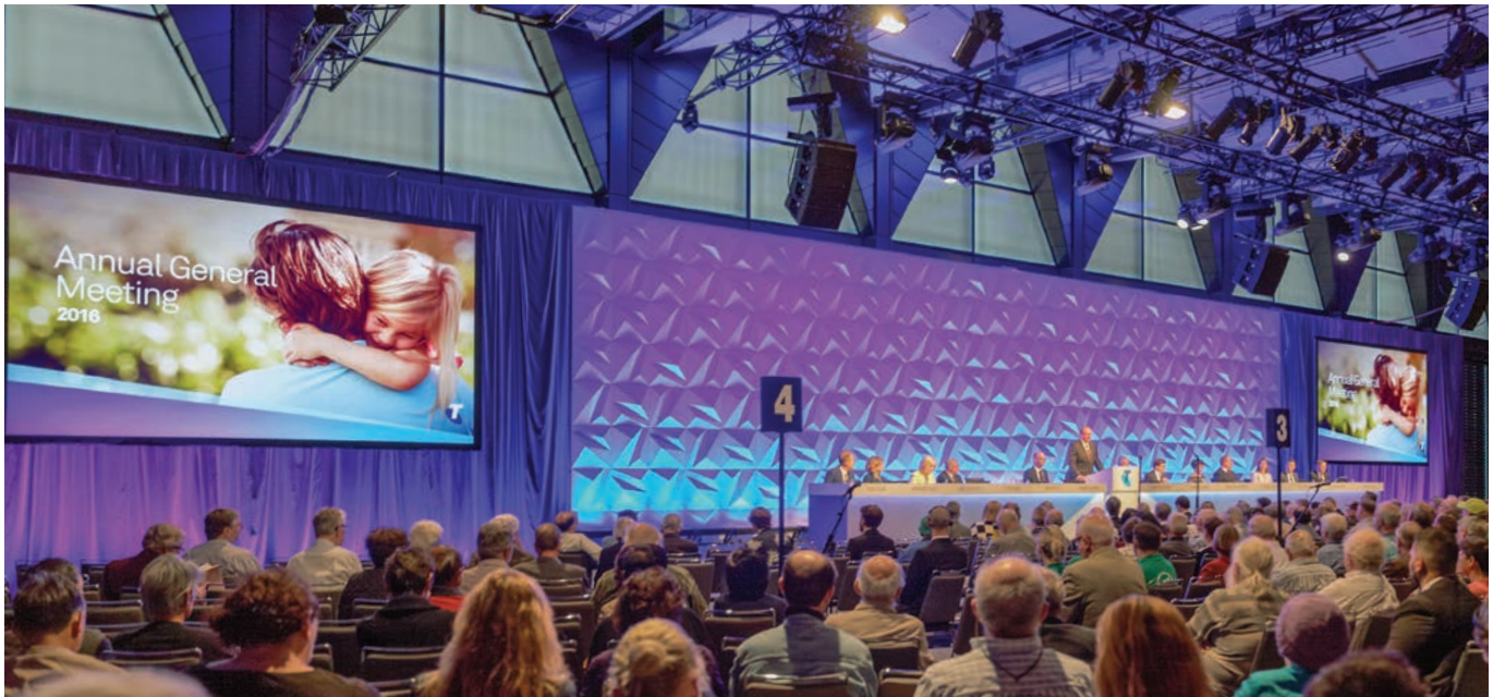
Telstra Annual General Meeting 2016

We value and facilitate a direct, two-way dialogue with our shareholders and investors. It is important we provide relevant information as quickly and efficiently as possible to shareholders (recognising the importance of meeting our continuous disclosure and other legal obligations to the market), and listen to and understand their perspectives and respond to their feedback.